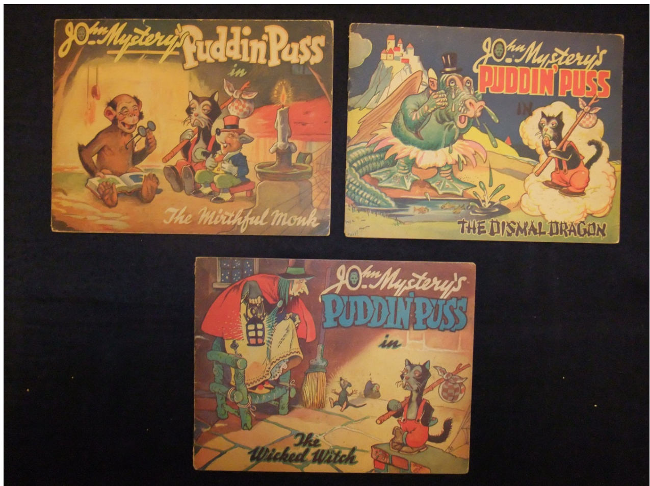
Figure 2. Selection of titles in the Puddin Puss Series

kitchen, he found a thin black kitten curled up in the middle of the saucepans. The starving kitten would only eat rice pudding, so John Mystery named him Puddin Puss. A little mouse, Dicky Doodle Dormouse, would emerge from hiding in a crack near the Castle door each night and join Puddin Puss in an adventure. On those adventures Puddin Puss always carries a basin filled with rice pudding. Mystery concludes his preface with the observation that Puss never laughs (Figure 2) and the authorial voice engages readers by rhetorically wondering if Puss ever will be happy.