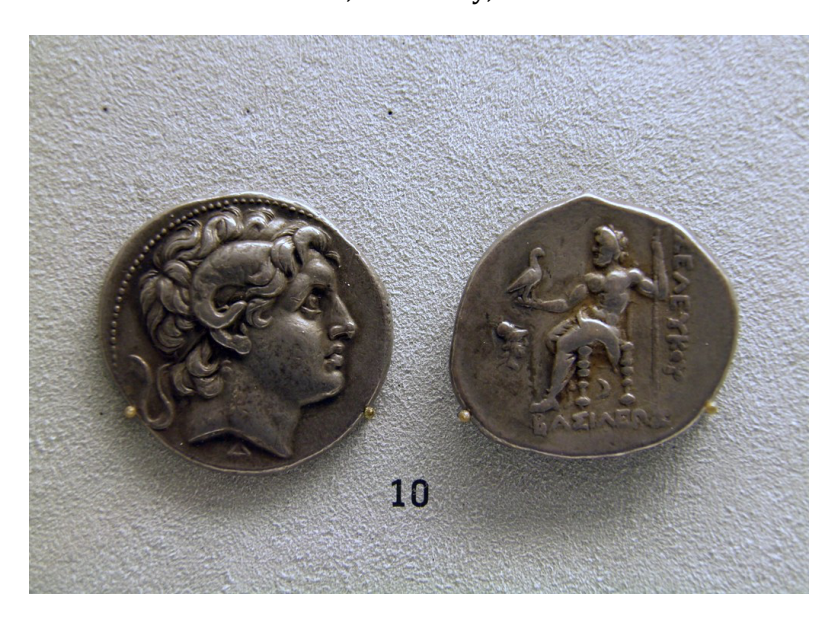
Alexander the Great Coinage (305-281 BC – From the British Museum.jpg)

to the power of the market. Recognisable images have operated in commerce in a manner very similar to heraldry and coats of arms. Although by far not the first pictogrammatic form in commerce, the development of systems of money can be seen as a way to legitimize a symbolic transfer of value. The image of Alexander the Great on coins was a major method of trusted sense of convertible value with the first coinage produced. Not only were the images a way for Alexander to express a divine status across territories of his supposed empire, but they also conveyed the sense of secured and verifiable value of the actual silver used in their construction. The aura of power and the sense of legitimacy has been a continuing feature of money and its conversion of value across individuals and, ultimately, across cultures.