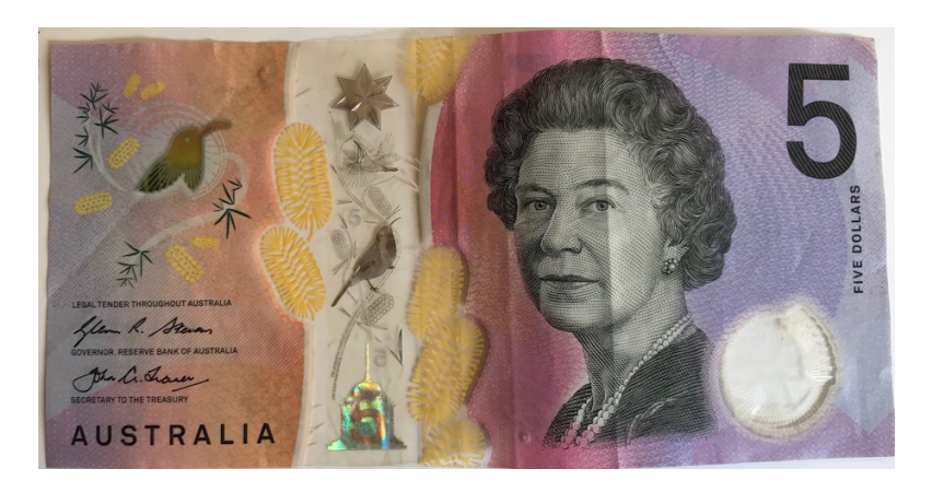
Australian 5-dollar note – up until 2022

Like the church spires, currency also established an ever-presence, ethereal yes, but tangibly carried by all individuals in public spaces. Currency connects as it plays a persona-like role of pre-existence and linguistically rich but convertible form of communication. Coats of arms, monarchs, key political leaders and national icons have become the templates for centuries of coins and paper currency that attempt to embody the trust, emotion, the sense of authenticity and the feeling of appropriate value exchange.