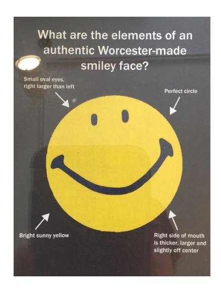
Smiley® logo via The Smiley Company

Savage, Jon 2009 "A design for Life" The Guardian . Access 24 May 2019. Available online: <a href="https://docs.google.com/document/d/1g45sZeGGzaWU-jg8Tv2ls5yS7knxrV">https://docs.google.com/document/d/1g45sZeGGzaWU-jg8Tv2ls5yS7knxrV</a> dG9rbm6CsqB8/edit