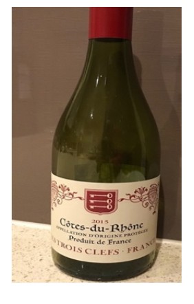
Yamaha and Côtes-du-Rhône: two "brands" that have words and a play with images

To capture this further connection of products and their stylized reformation into logos, it is useful to investigate the world of logos that allow brands to move seamlessly and with constructed consumer connection across massive areas of time and space. Most major automobile and technology brands and logos are virtually universally understood. Their universality is an amazing achievement that is built from an array of techniques - from the obvious advertisements to the way in which passers-by work to interpret what they are seeing. The logo privileges and shapes that interpretation through building a visual persona of value.