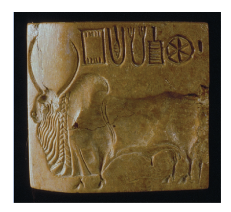
Zebu Bull used on ancient Indian forms of seals.

Moore and Reid cleverly identify these early seals as examples not of "brands" but "protobrands" (424) that essentially link their analysis of these early efforts at trademarks and identification of origins and value with the idea of proto-linguistics. Proto-brands thus predate the full economic meaning of brands, but nonetheless, articulate a relationship to trade and power in their presentation of image. Their extensive exemplification of proto-branding is mapped into Phoenician culture, Tyrian merchant work, and the Shang people of 1500 BCE as they signal historically the way that products and services move over space and time with a valued identification.