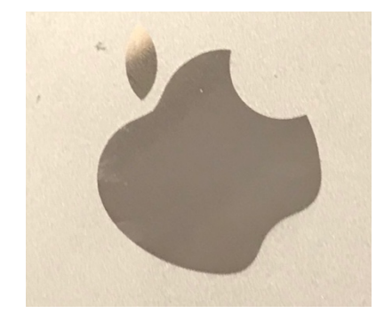
Microsoft and Apple: two "brands" that have no words

Car logos are equally interesting in their techniques of ensuring that the company that makes the vehicles is valued, trusted, and put into a hierarchical social reputation. Car logos become embedded with the core meaning of the brand. In our grouping below, there is actually remarkable similarity in car brands. Most are silver and their symbolic shape appears to at least connect to the circle in some way. Volkswagen is the only one of these four that actually uses a letter-driven logo most evidently, while it is possible to say that Mazda is also playing between something symbolically embodying wings and the letter M. Mercedes Benz, much like the blends of coats of arms in heraldry, builds its logo from the two shapes of the two companies of Mercedes and Benz