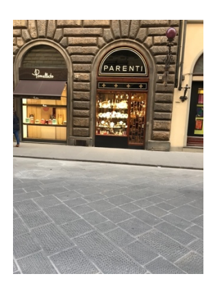
Street scenes of shops in Florence Italy: brands identified and promotional messages conveyed through their style

Commercial emotional connection thus defines one of the key long term symbolic constructions that operate as a highly visible precursor of emoji. From marketing literature, the idea of branding is very much a twentieth century phenomenon. But, as alluded to above through proto-branding, another commercial entity - the logo - needs to be investigated a little more fully in terms of how it manages the construction of identity and meaning of products across people, space and time. The images above of the street scenes of Florence work to construct a relationship of the products with an audience of potential consumers. Brand names, such as Tommy Hilfiger, MaxMara or the United Colors of Benetton - with their use of colour, font and stylistic flavour - define some of the essential features of logos in a contemporary world. They may be organised through text, but they work even more powerfully when they are converted to pictograms.