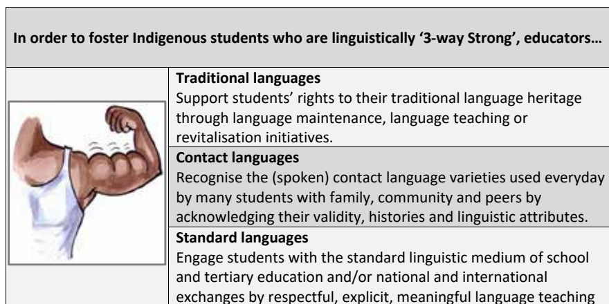
Figure 4. 3-way Strong: Placing traditional, contact and standard languages in schools

Note. Compiled from Angelo, 2009, pp. 5-6